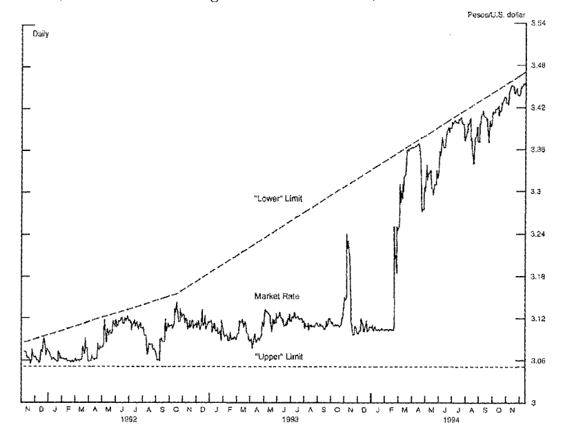
28 From: Can Currency Crises Be Prevented or Better Managed?: Lessons from Mexico FONDAD, The Hague, 1996, www.fondad.org